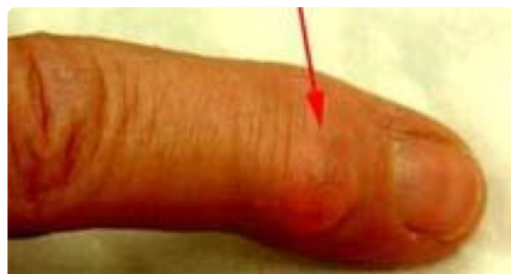
Mucous cyst of the index finger.