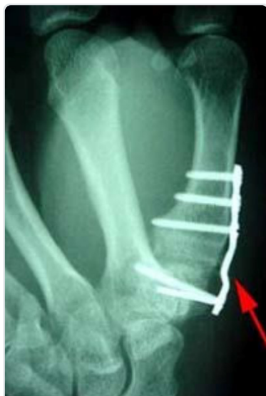
A joint fusion using a plate and screws at the base of the thumb.

The goal of joint replacement is to provide pain relief and restore function. As with hip and knee replacements, there have been significant improvements in joint replacements in the hand and wrist.