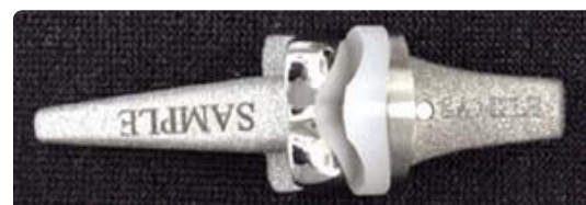
An example of a finger joint prosthesis used in joint replacement surgery.

Most of the major joints of hand and wrist can be replaced. A surgeon often needs additional training to perform the surgery. As with any evolving technology, the long-term results of the hand or wrist joint replacements are not yet known. Early results have been promising. Talk with your doctor to find out if these implants are right for you.