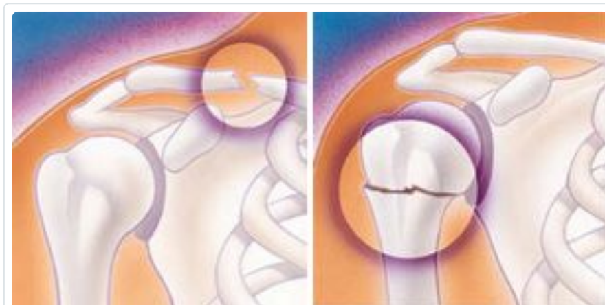
(Left) Fractured clavicle (collarbone). (Right) Fractured head of the humerus.